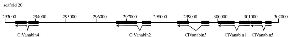
Fig. 1. Genome organization of Ciona intestinalis vanabins. The five vanabin genes ( CiVanabin1 to CiVanabin5 ) are clustered in an 8.4-kb genome region in Scaffold 20. The numbers indicate the relative nucleotide position in this scaffold. The putative exons are shown in black bars, and the orientation of transcription is shown by arrows. Note that the five genes are aligned in the same orientation as their transcription.